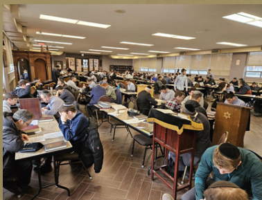
FATHER-SON YOM IYUN AS A ZECHUS FOR ISRAEL