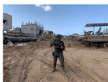
Spotlight on Yedidiah Rosenwasser (FYHS '18)