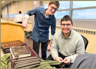
FYHS TALMIDIM MAKE TZITZIS FOR CHAYALIM