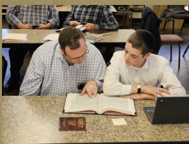
MISHNAYOS SIYUM AND LEARNATHON AS A ZECHUS FOR ISRAEL