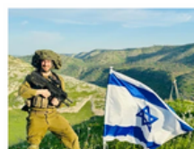
Spotlight on Reuven Isaacs (FYHS '10)