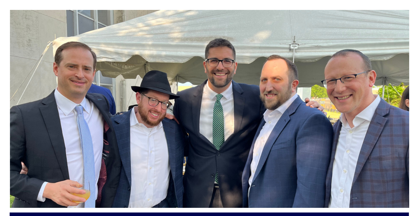
Inside the Issue