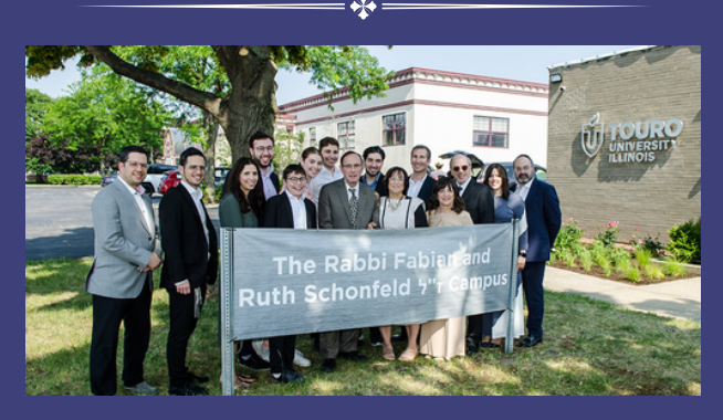
TOURO UNIVERSITY ILLINOIS HOLDS RIBBON CUTTING FOR NEW SKOKIE CAMPUS