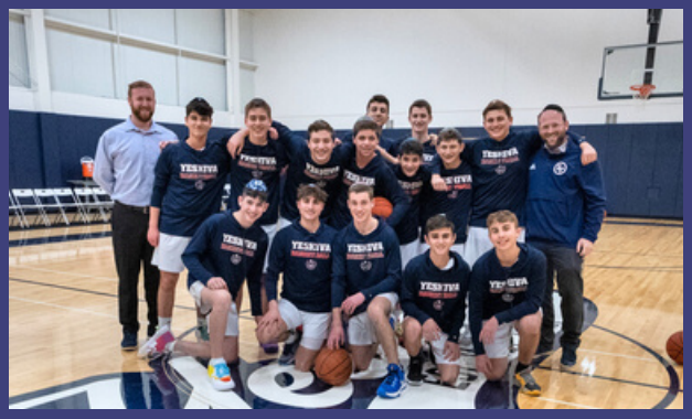
ROTHNER FAMILY GYMNASIUM OFFICIALLY OPENS